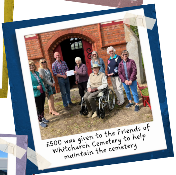
£500 was given to the Friends of Whitchurch Cemetery to help maintain the cemetery