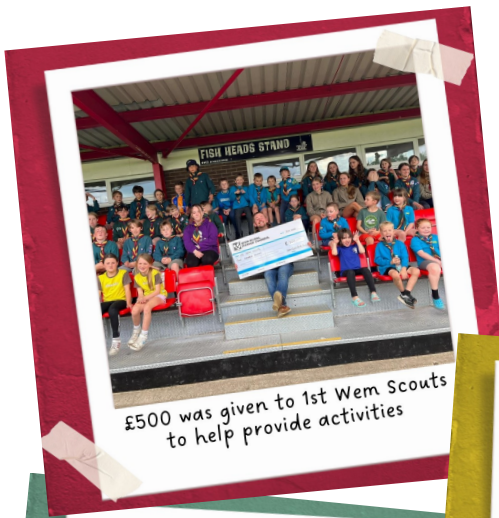
£500 was given to 1st Wem Scouts to help provide activities

Each year Wem Rural Parish Council supports local community groups with funding. Here's how some of that money has been spent.