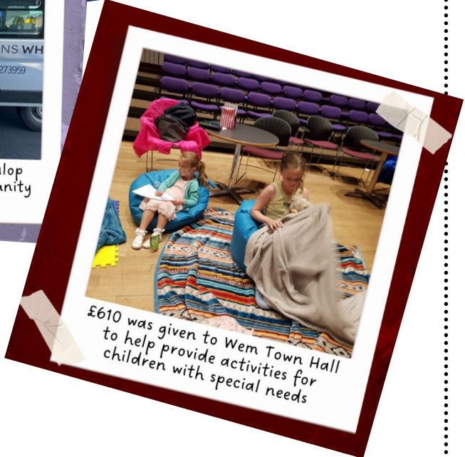
£610 was given to Wem Town Hall to help provide activities for children with special needs

Other groups to be awarded funding community grants are: