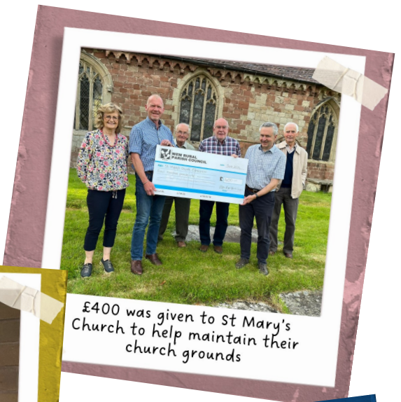
£400 was given to St Mary's Church to help maintain their church grounds