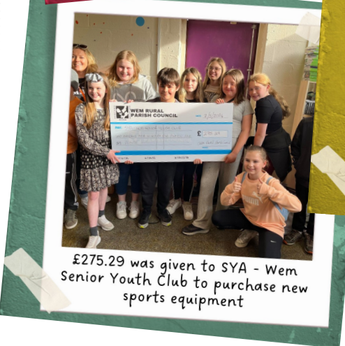
£275.29 was given to SYA - Wem Senior Youth Club to purchase new sports equipment