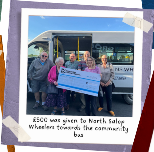
£500 was given to North Salop Wheelers towards the community bus