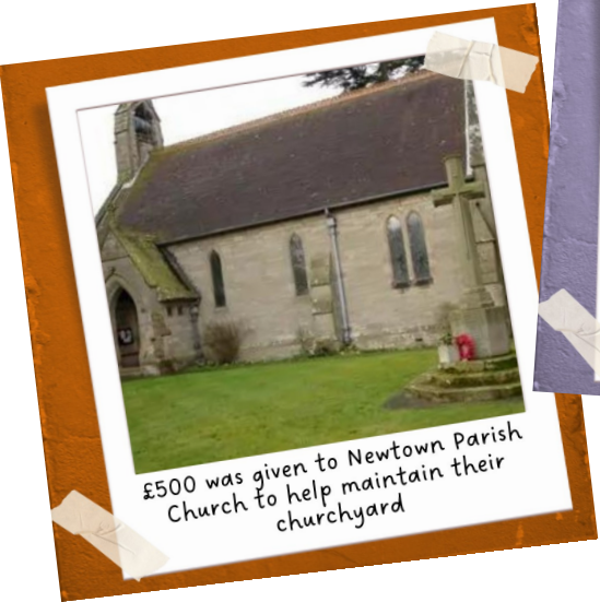
£500 was given to Newtown Parish Church to help maintain their churchyard